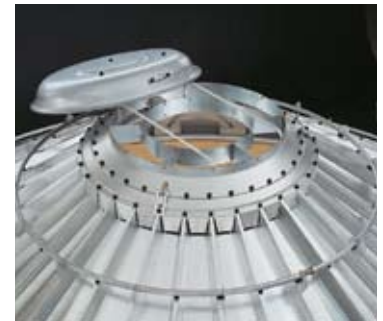
Giant 40-inch (1016-mm) fill hole.