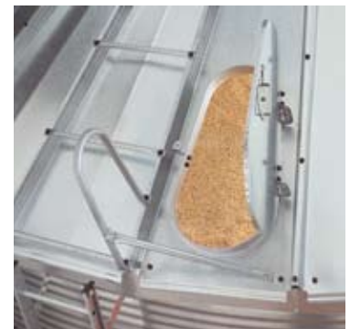
Large "obround" manhole for easy entry and exit.