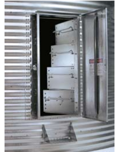
Brock's LATCH-LOCK® Walk-Through Bin Door.