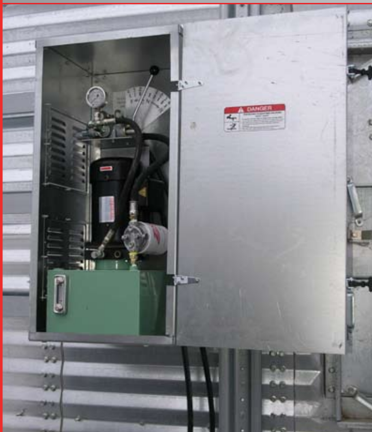
Bin sweep control is located on the bin exterior. Includes a hydraulic power pack for the Positive Drive System